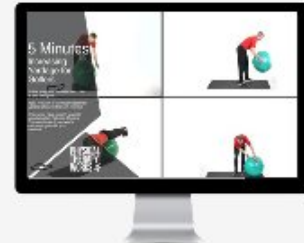
THERAPEUTIC CONTENT LIBRARY