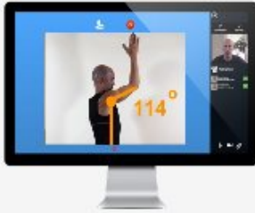
ONE-ON-ONE EVALUATIONS & CHECK-INS