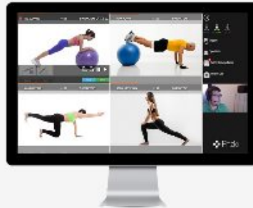
MONITORED THERAPY PROGRAMS